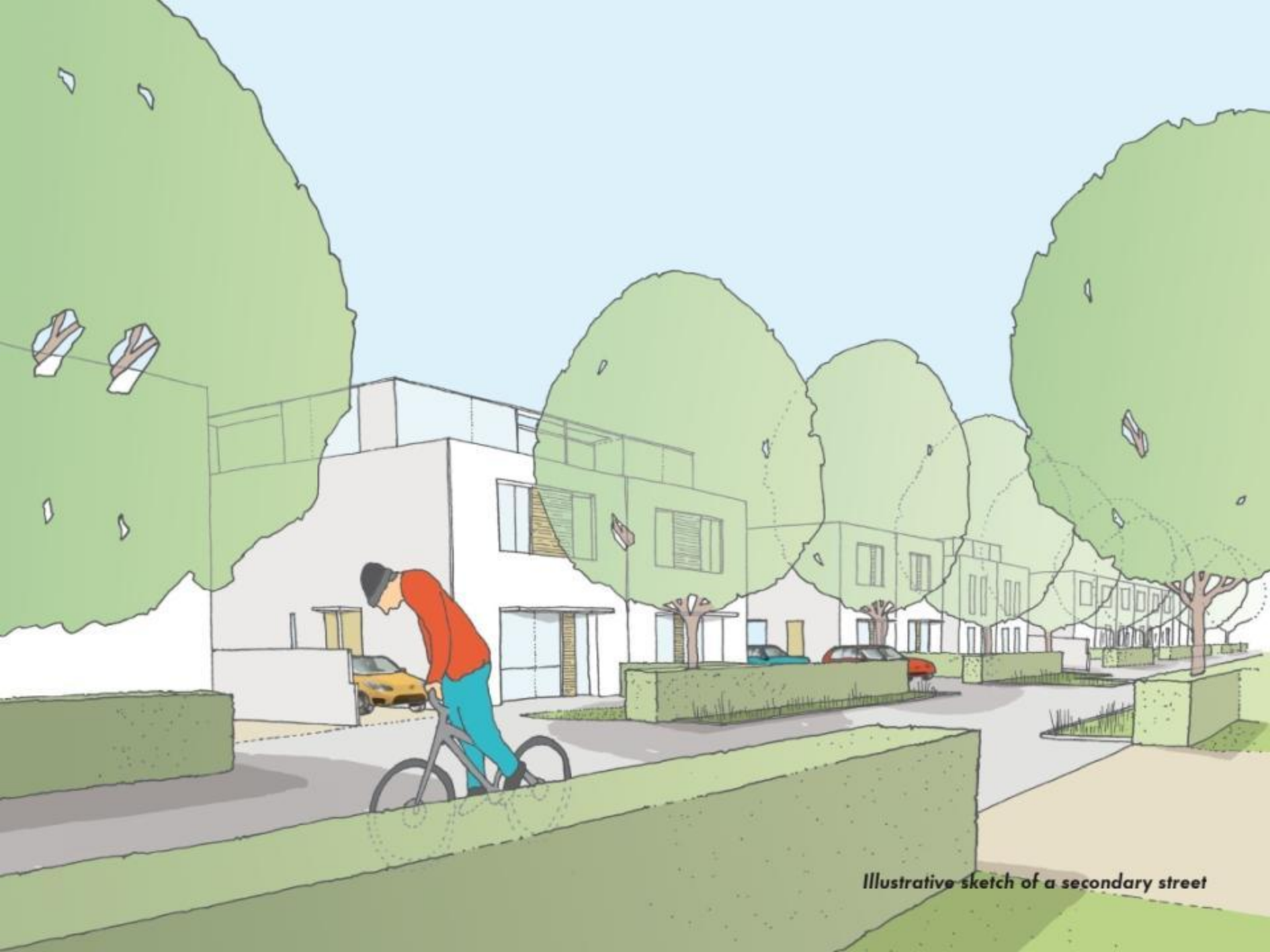
Illustrative sketch of a secondary street