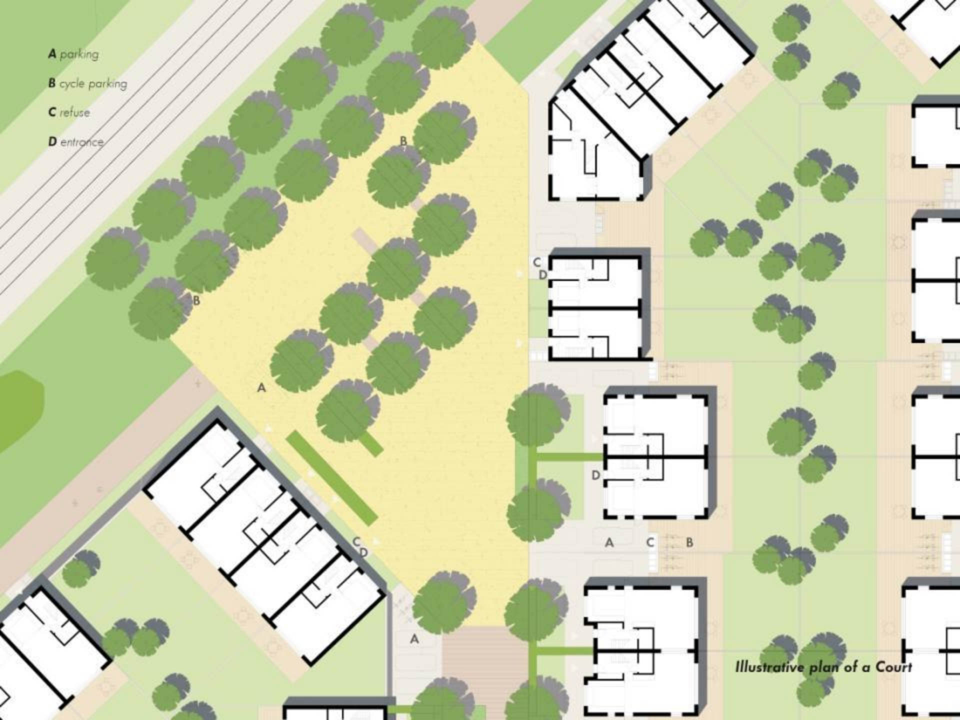
Illustrative plan of a Court