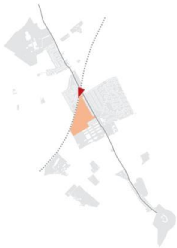
East Tilbury rail station