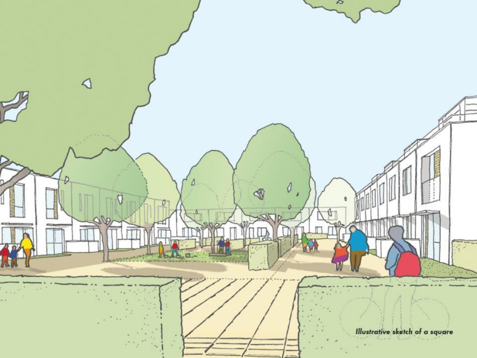
Illustrative sketch of a square