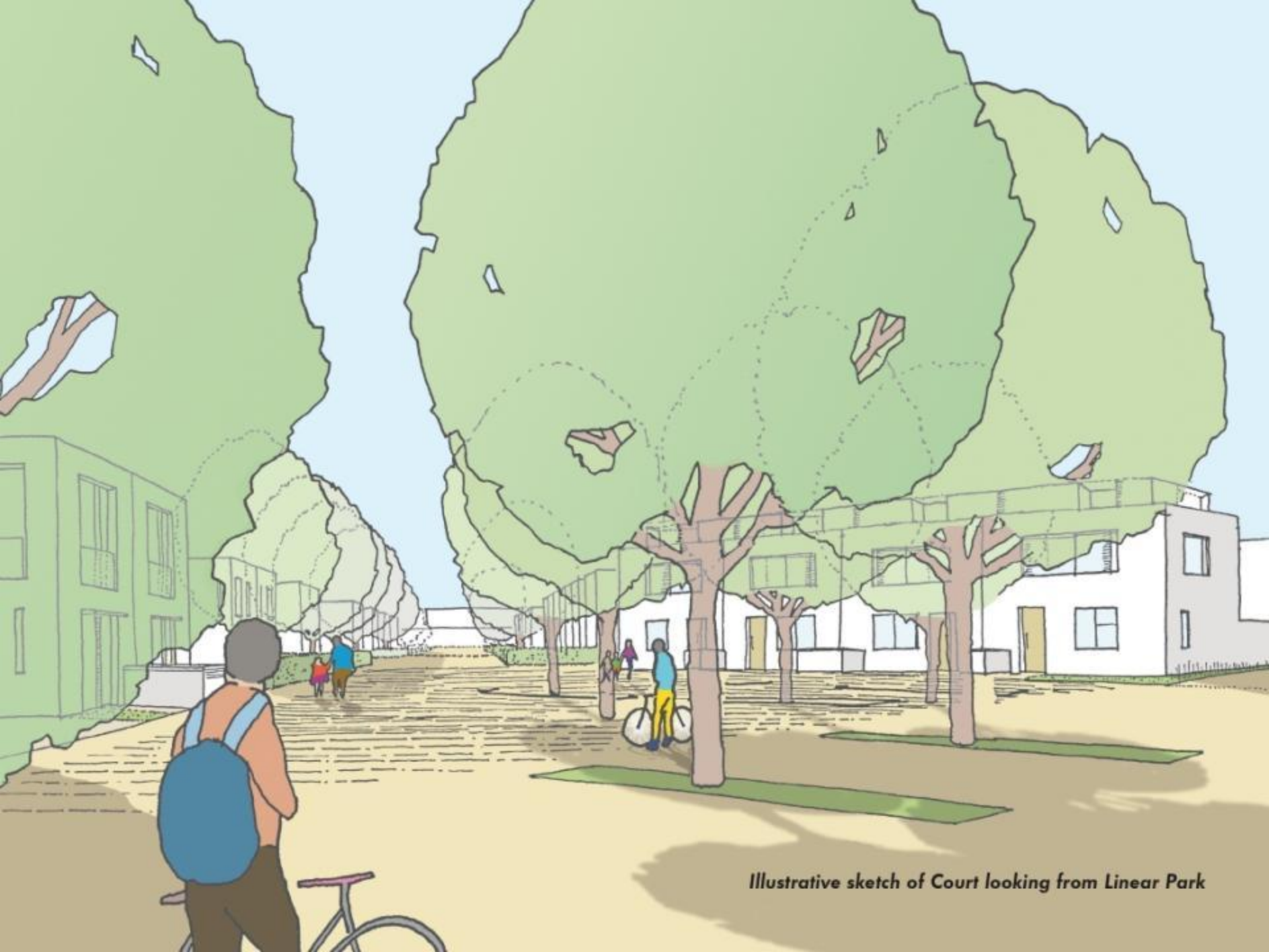
Illustrative sketch of Court looking from Linear Park